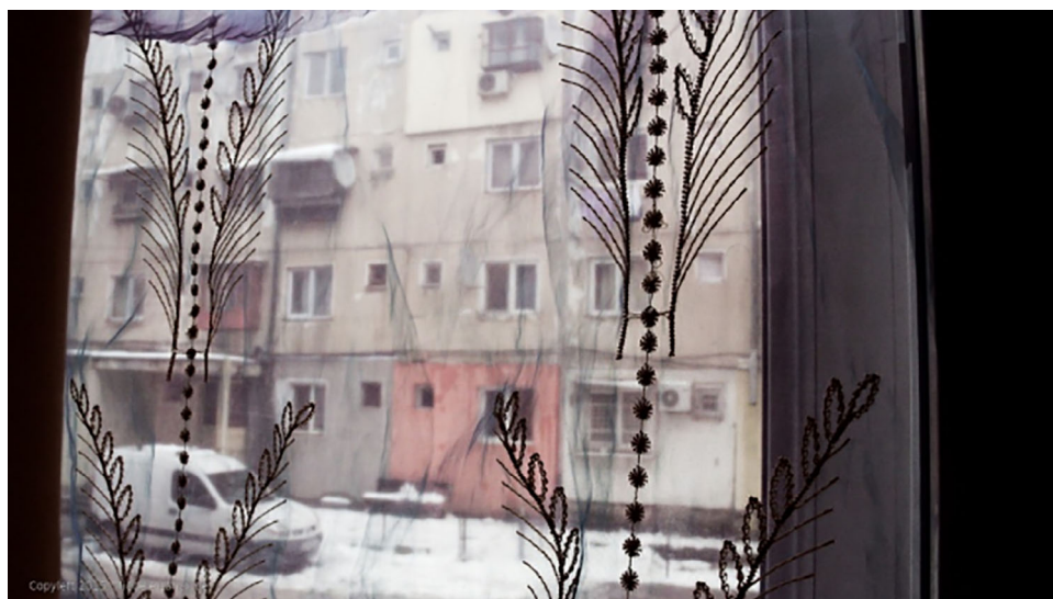
Figure 4: One of the blocs of Livezilor seen from Adrian’s room

It is through these stories, without a declared sense of direction but which allow for a circulation to happen, that a “route” is opened and an urban futurity, at first implicitly and then explicitly, is planned for. This is a plan where the flow is constantly interrupted—by withdrawal, lack of support, jail, precarity, and also collective shame and media denunciation of the “ghettos” of Bucharest in 21 st century Europe—and yet, through those interruptions, its foundational dispossession is allowed to continue.