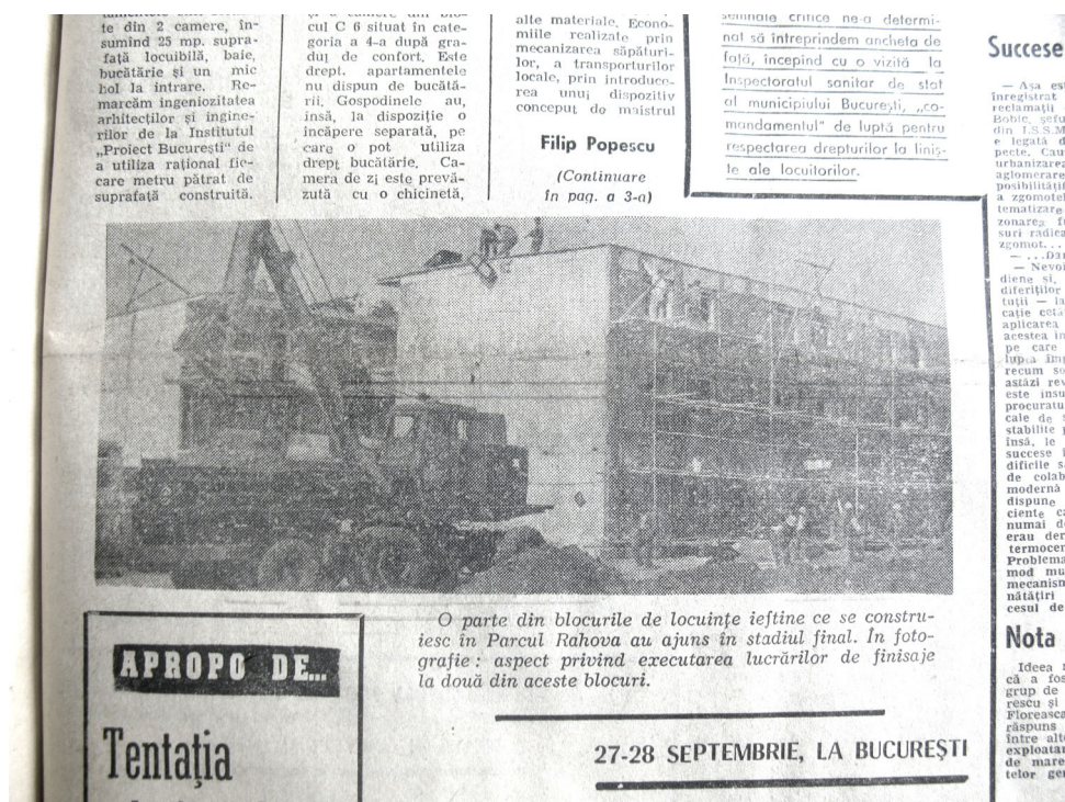
Figure 3: The first “nefamiliști” bloc, piloted in Rahova, near Ferentari (from the Comitetului Municipal București al PCR periodical, Informația Bucureștilui, 13 September 1968;)