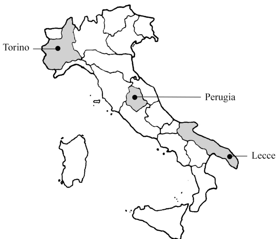
Figure 1. Location of the three cities involved in the study.

Within the toxicological risk assessment, an inhalation risk analysis was carried out for people living in Torino, Perugia, and Lecce on the basis of atmospheric concentrations of PM 10 and benzene in the years 2014 and 2015. The three towns (Figure 1) are located in different areas of Italy with different environmental and socio-economic characteristics [26,27]. Torino is located in the Po valley (Northern Italy), a heavily industrialized area with the highest levels of air pollution in Europe. Perugia is located in a medium-low polluted area in central Italy. Lecce is a city in southern Italy with a low industrial development.