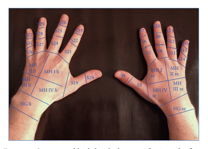
FIGURE 1: Segments of both hands for quantification of inflammatory associated enhancement of indocyanine green in SSc (S = segment, MH = middle hand).

(v) All FOI examinations were performed in the same room under a stable room temperature.