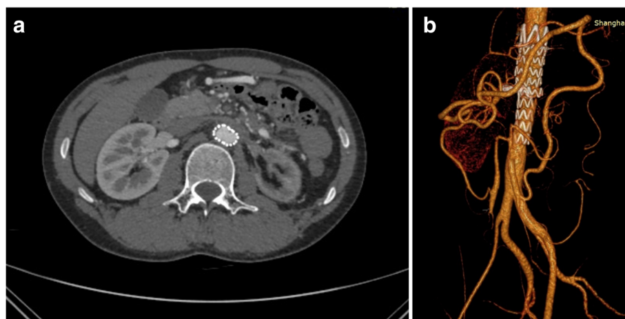
Fig. 2 One year postoperative follow-up of the patient showed complete aneurysm reduction and absorption of retroperitoneal hematoma

related to BD. Furthermore, the etiology of TAAA with BD was also confirmed by the prognosis after endovascular treatment and immunotherapy.