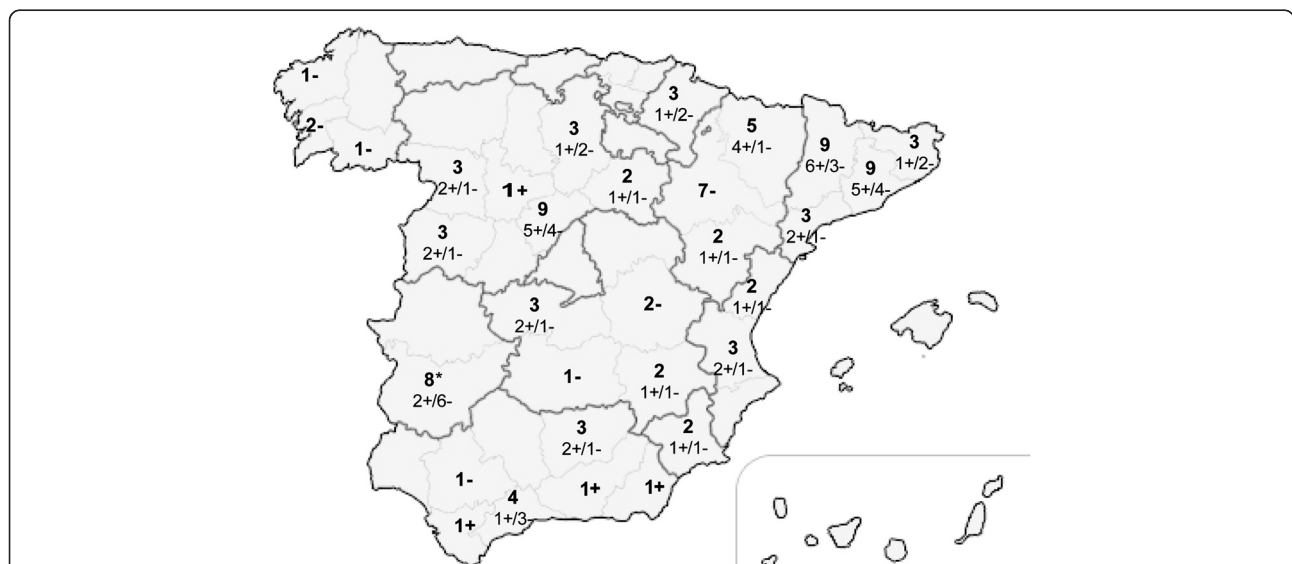
Figure 1 Geographical distribution of the sampled pig farms (n = 100) throughout Spain. The regions are delimited by dark grey lines and their provinces are delimited by light grey lines. The numbers in boldface indicate the total number of farms sampled at the indicated province, and the occurrence or absence of recent diarrheic outbreaks in the sampled farms is indicated by a "+" (n = 47) or "-" (n = 53) symbol, respectively. The asterisk symbol (*) indicates the only 8 sampled locations where pigs were raised outdoors.

All the farms surveyed had seropositive animals, and in 69 of them all the sera analyzed were positive. Figure 2 summarizes the numbers of farms in which all the animal sera tested from a given age were positive, versus the numbers of farms in which some negative samples were found. Only the farms from which 9 or more