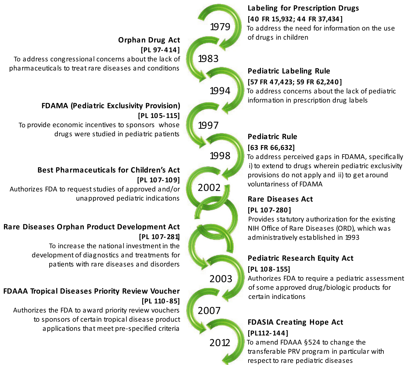
Figure 1 Evolution in pediatric drug legislature; image created with content from Tolbert et al. 1 FDA, US Food and Drug Administration.

With respect to extemporaneous preparation, we have also observed trials in which existing dosage forms were modified, and co-administered foods/beverages interfered with the bioavailability of the active drug compound, resulting in unexpected disposition profiles and, in some cases, failure to satisfy bioequivalence criteria. 7 Through Figure 2 , derived from a study in healthy volunteers, we illustrate the impact of a pediatric dietary staple (apple juice) on the systemic exposure to a medication. 12 Prior to our improved understanding of the impact of drug–nutrient interactions on presystemic drug metabolism and transport, it was not uncommon to encounter pediatric trials permitting concomitant juice administration, and we still see studies that permit flavored beverages (e.g., fruit punch), despite the fact that most contain apple juice as an ingredient. Failure to recognize or account for the effect of food and formulation during