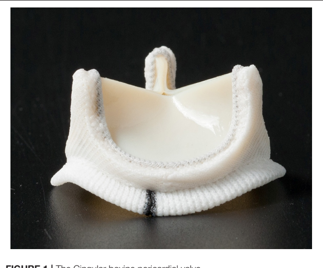
FIGURE 1 | The Cingular bovine pericardial valve.

Aortic or mitral valve replacement was performed at the discretion of the investigator using either routine median sternotomy or upper hemisternotomy. Ascending aortic and venous cannulation was performed, standard cardiopulmonary bypass commenced, and mild hypothermia applied, followed by an induction of cardiac arrest by antegrade or combined with retrograde infusion of del Nido or Buckberg blood cardioplegia.