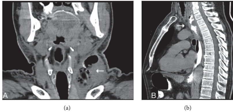
FIGURE 1: Computed tomography (CT) findings. (a) Inflammation and an abscess on the left side of the neck (arrow). (b) Inflammation of and contrast leakage into the left anterior mediastinum (arrow).