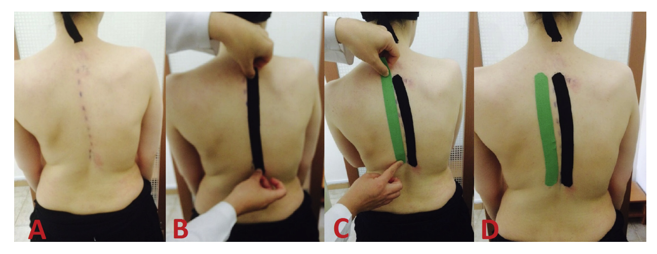
Fig. 2. KT without tension or paper off technique application: over the thoracic area (between T3 and L1) for the convex side (from the origin of the muscle to the insertion point) for the concave side (from the insertion of the muscle to the origin point). A. Determination of muscle localizations. B. Application for the convex side without tension. C. Application for the concave side without tension. D. Image after post-treatment KT application without tension.