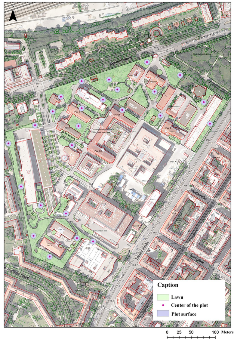
Fig 2. Detailed map of the studied site with plot positions.

https://doi.org/10.1371/journal.pone.0225347.g002