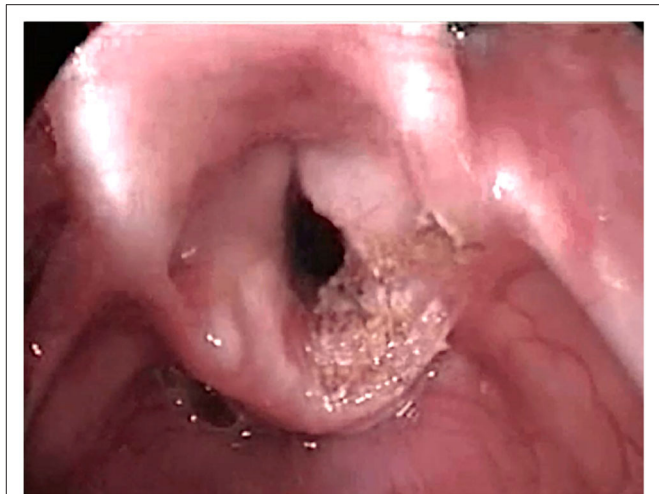
FIGURE 1 | CO 2 Laser right partial arytenoidectomy.

In 1993, Crumley (21) proposed a variation of this procedure: endoscopic laser medial arytenoidectomy, preserving part of the cartilage including the vocal process, to reduce the consequences on the voice function. Bad voice quality is the main adverse effect