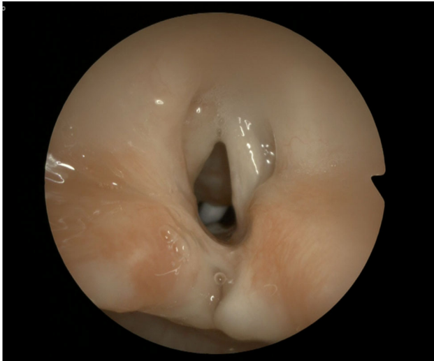
FIGURE 2 | Result after CO 2 laser left posterior cordotomy.