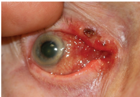
FIGURE 2: Thickened conjunctiva and caruncle showing red deposits.

organs, including the orbit [1–3]. It can be both systemic and localised [1, 7]. Amyloidosis of the conjunctiva and eyelid is a rare entity that is typically benign [5, 6, 9]. Preceding causes for amyloidosis can include trauma, infection, and inflammation [5].