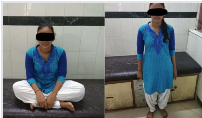
Figure 3: Clinical photo showing good functional outcome.

Ours were a rare case, wherein the resection of the tumor resulted in a large defect. The dilemma present was whether to reconstruct the proximal femur with allograft or whether to reconstruct the joint with tumor prosthesis. Vascularized bone grafts are considered as the best method to replace large bone defects due to their ability for faster incorporation and