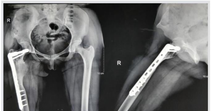
Figure 4: Full incorporation of the graft with no recurrence at 2-year follow-up.