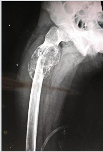
Figure 1: Aneurysmal bone cyst in the proximal femur with pathologic fracture.