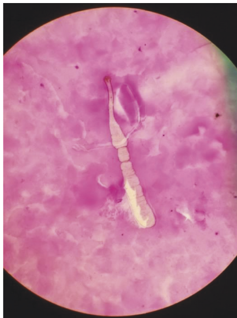
FIGURE 2: Microscopic examination at 40x magnification demonstrated the neck, scolex, and partial strobila of the cestode in a background of secretory debris.