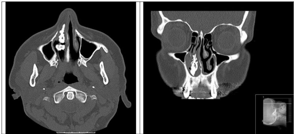
Fig. 2. CT images confirming the rhinolith.