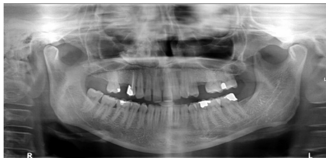
Fig. 1. Dense opacity projected over medial inferior aspect of right maxillary sinus.

A subsequent computed tomography (CT) scan then confirmed a densely calcified mass within the right nasal cavity with mucosal thickening, closely related to the turbinate, demonstrating expansion of the lateral nasal wall, Fig. 2.