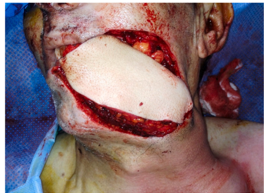
Fig. 4. The deltopectoral (DP) flap in position.