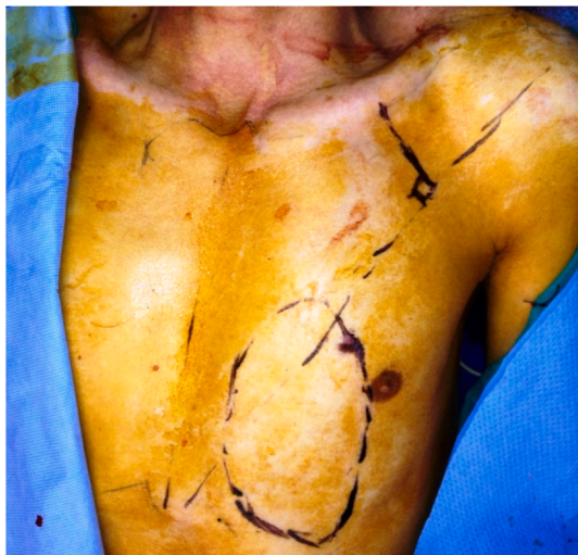
Fig. 3. The deltopectoral (DP) flap designed.

The multidisciplinary team deciding on the treatment options included surgeons, oncologists, radiotherapists, ENT surgeons, radiologists. The decision was made to treat the patient with the surgical approach with postoperative radiotherapy (PORT) and postoperative chemotherapy (POCRT). Considering the patient's age, general history, the size of the tumor, the prognosis was poor.