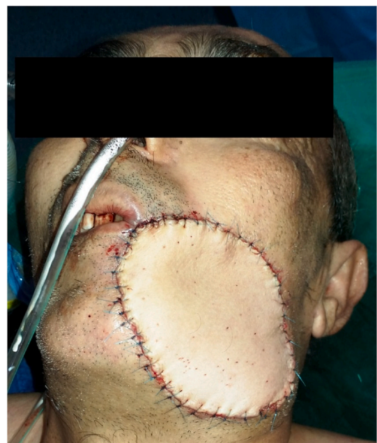
Fig. 5. End of surgery.

The main treatment of surgical management of head and neck tumors is to achieve satisfactory functional and aesthetic results (Fig. 5); reconstruction of large defects requires a careful restoration of all missing components, adequate texture matching, and functional restoration and the contralateral cheek which serves as a template in reconstruction modalities [7]. The decision-making and the choice of