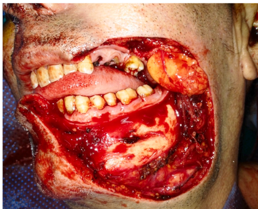
Fig. 2. Full-thickness cheek resection.