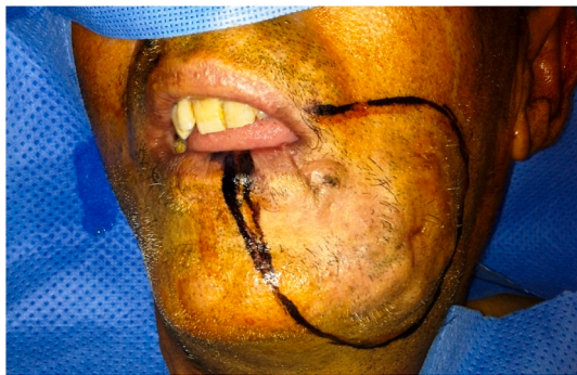
Fig. 1. Preoperative time (surgical margins designing of squamous cell carcinoma).