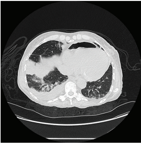
FIGURE 2: Thoracic CT reveals a loop of bowel incarcerated into the pericardial cavity. This image can be easily mistaken for pneumopericardium secondary to postoperative changes. Right lower lobe consolidation may be appreciated as well.

demonstrated an intrapericardial hernia which included a portion of the transverse colon; see Figures 1 and 2.