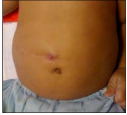
Figure 5: Appearance of stoma after few months of operation.