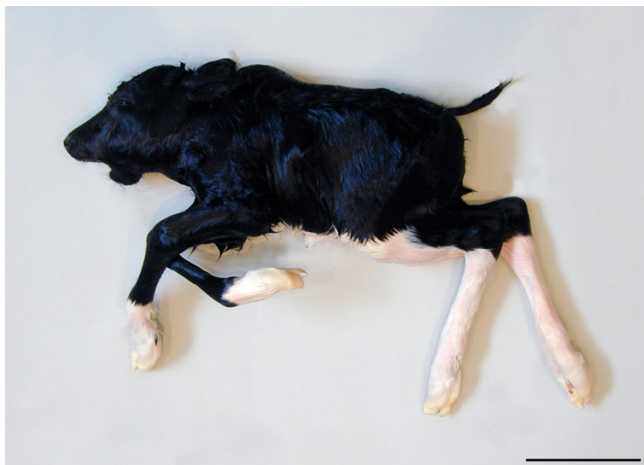
Figure 1 Bovine brachyspina syndrome in a Danish Holstein calf (case DK2). The calf is growth retarded with shortening of the spine and prominence of the thoracic spinous processes. Notice inferior brachygnatism and long slender legs. Bar = 15 cm.

The volume of the thoracic cavity was reduced and almost occupied by an enlarged heart. The ribs radiated from the spine with non-parallel intercostal spaces. The number of ribs was reduced to 11 in each side, but they were difficult to separate due to the presence of extensive synostoses. The lungs had congenital diffuse atelectasis, were of reduced size and compressed by the heart. Low-grade hydrothorax and hydropericardium was found. The heart had a round shape due to dilation of the right ventricle and hypertrophy of the corresponding myocardium. A high interventricular septal defect was present. Truncus pulmonalis and aorta arose separately from the right ventricle (dextroposition of the aorta). The basis of aorta was dilated.