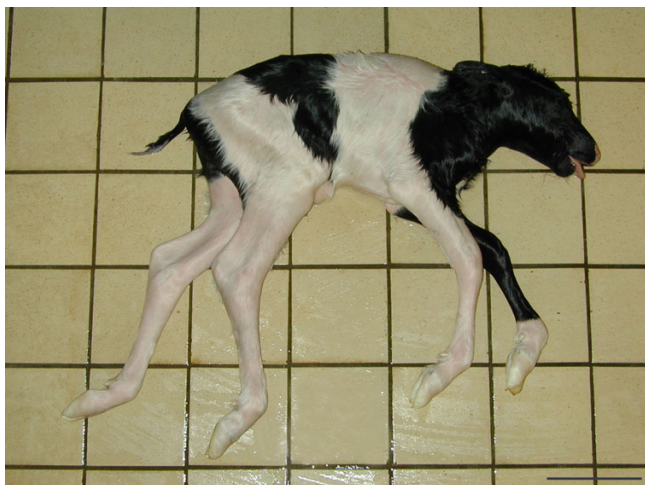
Figure 5 Bovine brachyspina syndrome in a Danish Holstein calf (case DK3). The calf has reduced body weight and significant shortening of the spine. Additionally, a mild inferior brachygnatism is present and the legs are long and slender. Bar = 15 cm.

than one syndrome, as the morphology was not completely identical. This point of view cannot be completely disproved, but it is not surprising that a certain variation is seen. Studies of CVM in Holstein cattle, which is due to a single base mutation [6], have demonstrated that phenotypical variation occurs. This variation is expressed in the severity of vertebral malformation as well as in the prevalence and type of internal organ defects [7,8]. Phenotypical variation is also seen in other skeletal malformations due to single genes, i.e. syndactylism and chondrodysplasia [9,10]. It is possible that a certain morphological variation of the brachyspina syndrome, which could explain the observed differences, could occur as well. At present, a diagnosis of the brachyspina syndrome should be based on the general appearance of abnormal calves (Figs. 1, 5 and 6). A detailed examination of future cases should be performed so that the variation of the syndrome can be determined and DNA should be stored to establish an exact diagnosis if a genotyping test becomes accessible.