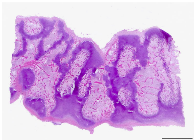
Figure 3 Photomicrograph of an area of the thoracic spine showing severely disturbed organisation of vertebrae. Irregularly ossified areas are separated by cores of cartilage omitting identification of individual vertebrae. Haematoxylin and eosin. Bar = 5 mm.

The pedigree was compared to pedigrees of the two other Danish cases. The parents were genetically related to the other cases (Fig. 4).