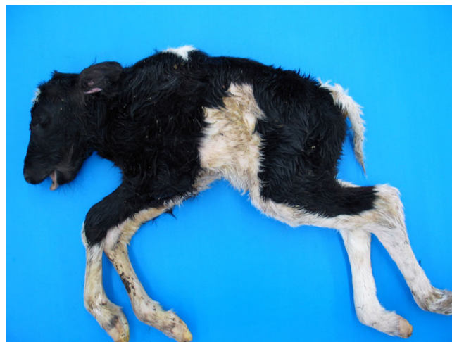
Figure 6 Bovine brachyspina syndrome in a Dutch Holstein calf (case NLDI). The calf has significant shortening of the spine and prominence of the thoracic spinous processes. The body weight is reduced to 10.5 kg. Inferior brachygnatism is present.

The genealogical examination showed that the cases occurred in a familial pattern and that the parents of each calf were genetically related. A common ancestor to all parents (sire A) was found in generation VI (Fig. 4). The occurrence of the defective calves might therefore be explained by transmission of recessive alleles from this sire to the calves. Sire A and his son (sire B) are widely used US Holstein sires and it is therefore possible that they occur in the pedigree of the parents by chance. It has previously been reported that widely used sires may occur as common ancestors in the pedigree of malformed Holstein calves fortuitously [7,8]. Consequently the observation cannot be regarded as a distinct proof for an inherited aetiology of the brachyspina syndrome and the sire cannot at present be regarded as a carrier of the defect. However, the observations support the hypothesis of a genetic