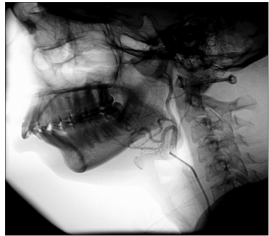
Figure 4: External carotid artery angiogram reveals supply of the hypervascular mass by lingual artery