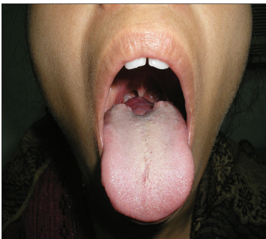
Figure 5: Regression in the size of the swelling post treatment

hyperthyroidism was made. Presurgical angiogram revealed high vascularity and supply of the lingual thyroid by the lingual artery [Figure 4]. Hypervascularity and the location of swelling made anesthesia and surgery in the base of tongue a high risk one and surgery was abandoned and the patient was referred for radioiodine treatment. The patient was put on a low iodine diet for 2 weeks and was administered 20 mCi of ^{131}\text{I} and was closely observed in the high dose therapy ward for 3 days. After 4 weeks the patient became clinically euthyroid. The swelling also regressed. At 3 monthly follow-up no obstructive symptoms were noticed. The swelling had markedly reduced [Figure 5]. The biochemical parameters were suggestive of hypothyroidism with FT3 = 2.0 pg/ml, FT4 = 0.7 ng/ml, and TSH=14.8 \mu\text{IU/ml} . The patient was started on tablet thyroxine 50 \mu\text{g}