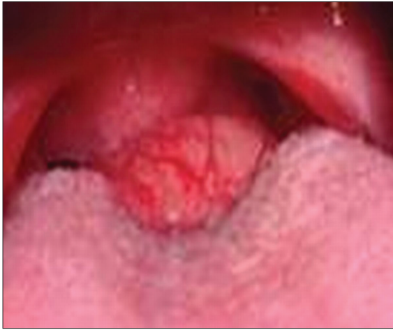
Figure 1: Midline mass in the posterior aspect of the tongue. The mass is congested with numerous vessels