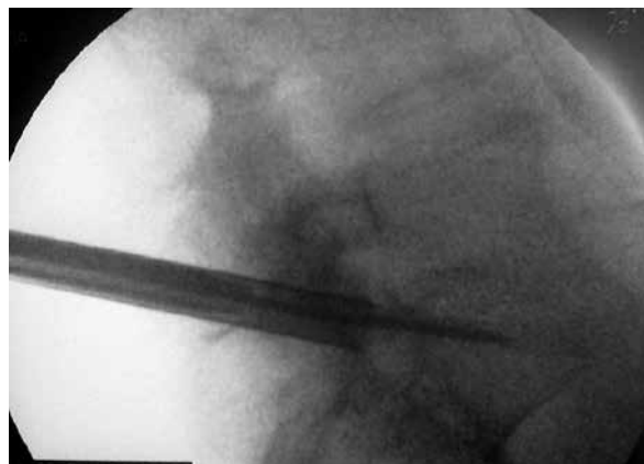
Photo 1. Lateral view of the guide K-wire with obturators centralizing the bone cutter entering the L5/S1 intervertebral space

The mean preoperative VAS score for leg pain was 8.2 (range: 6–10), whereas the mean ODI was 78.5% (range: 62.2–97.7%). The average duration of symptoms was 2.3 months (range: 3–12 weeks). At the last follow-up, at least 6 months postoperatively, the mean VAS score for leg pain was 1.8 (range: 0–3.5), whereas the mean ODI was 18.8 (range: 7–34%). One patient showed excellent and two other good results according to the Macnab outcome classification at the last follow-up examination. All patients were retired and professionally not active. The mean period before return to normal or before disc herniation activity was 2.2 weeks (range: 5 days – 4 weeks). No recurrent