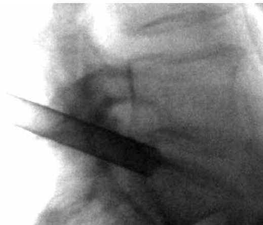
Photo 3. Working cannula placed in the L5/S1 intervertebral space

herniation was observed in the group. We did not observe clinical instability at the operated level. During the study, no patient showed neurological deficit or infection.