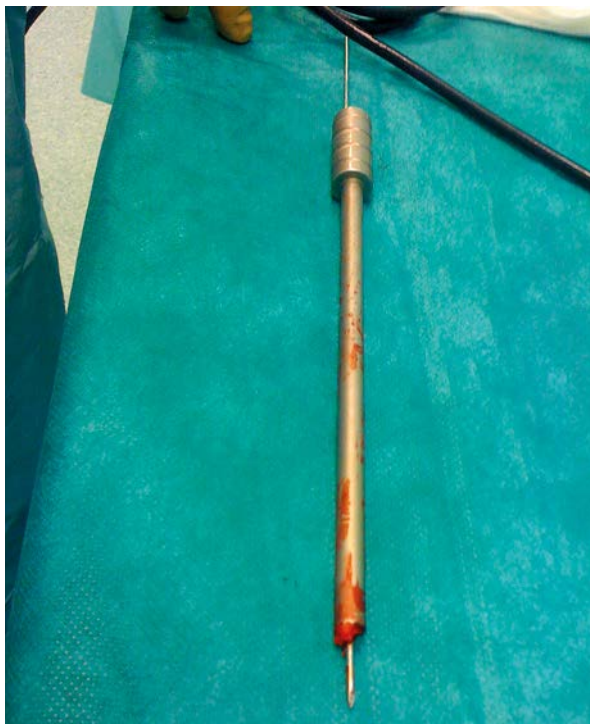
Photo 2. The bone cutter removed with the guiding K-wire and resected part of the facet. Note K-wire is centralized in relation to bone cutter