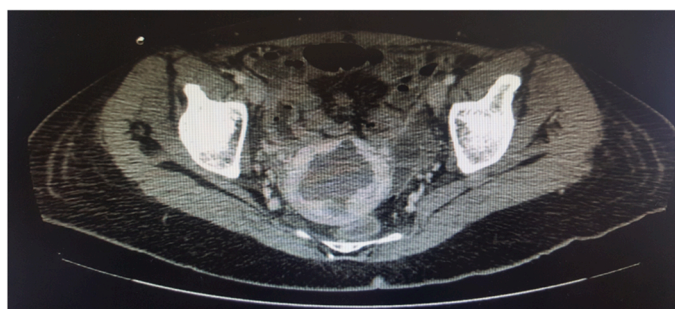
Fig. 4. CT scan showing the extension of the thermal lesion beyond the serous membrane leading to an intestinal lesion.

In a series comprising 60 TRFA, our group [9] reported one intestinal perforation requiring surgery and intestinal resection. Other authors recently published a case of intestinal perforation managed in the same way [21].