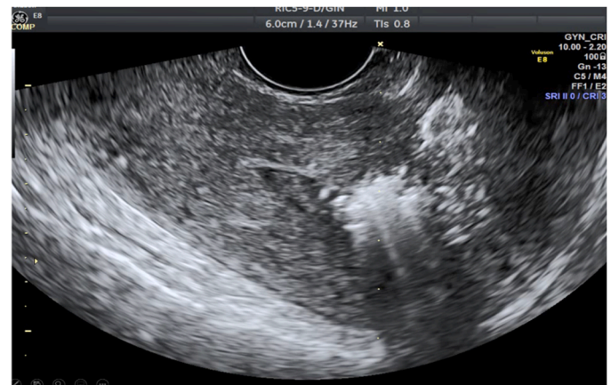
Fig. 2. Sagittal view of the uterus in a transvaginal ultrasound. Notice the change in echogenicity after the treatment with Radiofrequency to the myoma.

TRFA was performed under general or epidural anesthesia, prior administration of prophylaxis with intravenous cefotaxime 2 g in an outpatient setting. The needle electrode was inserted under ultrasonographic visualization via the anterior or posterior fornix of the vagina until the tip was located within the fibroid, 0.5 cm deep to the pseudo capsule. In each of the ablation shots, the power released and the change in tissue impedance were displayed on the radiofrequency generator screen, and a permanent change in the echogenicity of the treated tissue was seen in the ultrasound image (ie, it becomes hyperechoic). After each target area was treated, the needle was moved to an adjacent, untreated part of the fibroid, and the ablation process was repeated. The procedure was considered complete when a change in echogenicity was detected in approximately 80% of the fibroid volume (Fig. 2). Appropriate safety measures were taken to avoid thermal damage (Fig. 3). After the procedure, all women remained under observation for 4 h