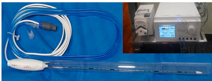
Fig. 1. Radiofrequency generator and coagulation needle electrode.

Data were collected systematically using questionnaires. A protocol was designed to collect sociodemographic and clinical data, as well as variables associated with the fibroid and complications. Information relative to complications was also retrieved from the clinical history. Imaging data for the most severe complications occurring in the study population were also recorded.