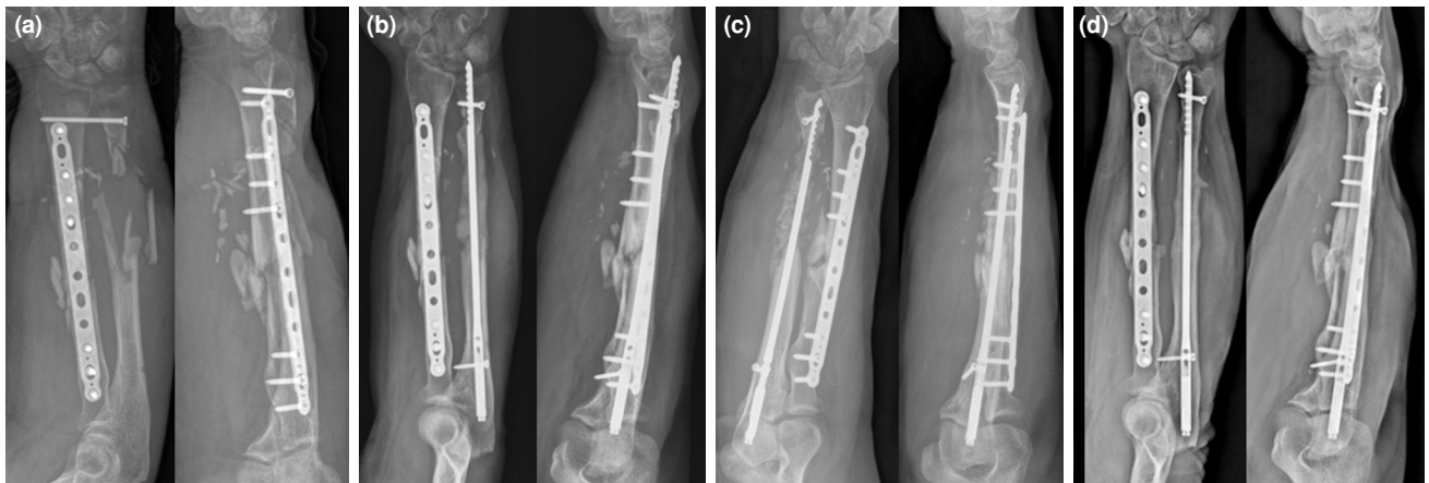
FIGURE 3. (a) Preoperative anteroposterior and lateral radiographs before the first-stage procedure in a patient with the acute ulnar bone loss after Grade 3C both arm open fracture. (b) Anteroposterior and lateral radiographs after the first stage of IMT. (c) Anteroposterior and lateral radiographs after the bone grafting procedure. (d) Anteroposterior and lateral radiographs at 33 months after the second stage of the induced membrane procedure on an intramedullary nail in the same patient.