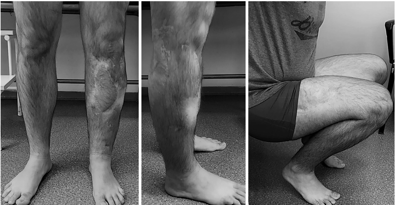
FIGURE 2. Good functional outcome after flap surgery and induced membrane technique.

Ten patients had associated infection before the application of IMT. Among these, all of them affected the tibia due to open fracture with Staphylococcus aureus being the most prevalent