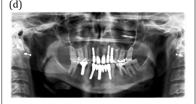
Fig. 2 A 43-year-old female with oligodontia with missing tooth numbers 12, 22, 23, 35, 33–43 and 45. a Harvesting of outer table calvarial bone blocks. The blocks were harvested piece-by-piece. b Reconstruction of the mandible at tooth locations 33–43 by placing the calvarial grafts lingually. The grafts were fixed with screws from the buccal side. The implants were placed after 4 months. c Clinical image of the end result. A fixed bridge was made in the region 33–43. d Orthopantomogram of the end result at 21 months follow-up showing negligible marginal bone loss around the implants

bone could be handled well, and the pieces fitted nicely onto the alveolar process.