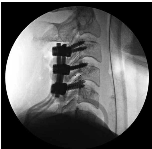
Figure 2. The postoperative image shows C3–C5 laminectomy and lateral mass screws.

C3). Placement of C3 to C5 lateral mass screws was performed for cervical spinal stability (Fig. 2). The patient gradually recovered and was admitted to the neurosurgical intensive care unit for postoperative care.