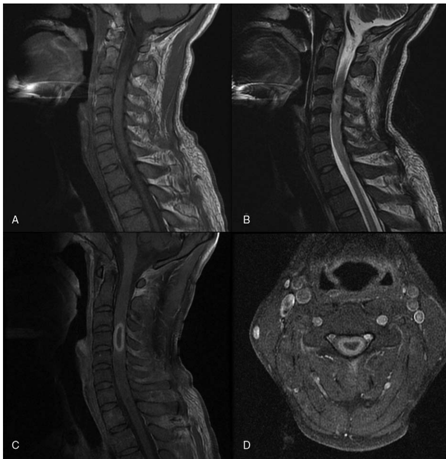
Figure 1. Magnetic resonance imaging (MRI) of the patient: (A) T1WI shows spinal cord swelling. (B) T2WI shows hyperintense lesion at C3 and C4 levels. (C) Contrast-enhanced T1WI shows typical target sign. (D) Axial view of the contrast-enhanced T1WI shows intramedullary lesion.