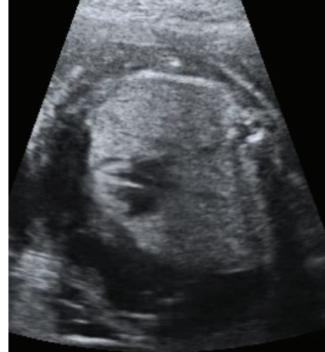
FIGURE 3: Axial scan of the fetal chest: the heart was squeezed by the hyperechoic lungs.