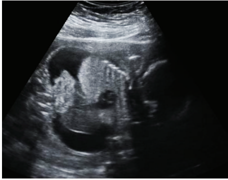
FIGURE 1: Coronal scan through the fetal chest and abdomen revealed bilateral echogenic lungs and ascites.