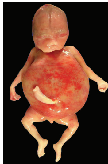
FIGURE 4: Postabortion: generalized edema with markedly distended abdomen.

The aborted fetus weighed 450 g and had a distended thorax and abdomen and deformation both ear lobules. Postmortem examination revealed generalized edema and markedly distended abdomen compatible with hydrops fetalis (Figure 4). The abdominal cavity showed a large amount of clear yellow fluid and an incomplete rotation of the intestine. An intrathoracic examination showed the enlargement of the right and the left lungs, which weighed 7.4 and 8.7 grams, respectively. The right lung had 3 lobes, while the left had one lobe. Costal impressions were observed on the external surface of both lungs (Figure 5). Microscopic examination revealed thinning of the epithelium at the periphery of the lungs with the development of intraacinar capillaries. The larynx showed complete obstruction at the infraglottic level caused by the overgrowth of the cricoid cartilage (Figure 6). Neither tracheoesophageal fistula nor esophageal atresia was observed. Autopsy findings were compatible with laryngeal atresia type II described by Smith and Bain in 1965 [2]. The cord blood cytogenetic study revealed 46, XY karyotype.