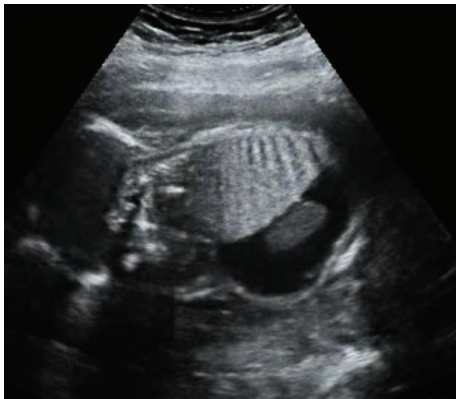
FIGURE 2: Sagittal view: note the inversion of the diaphragm.