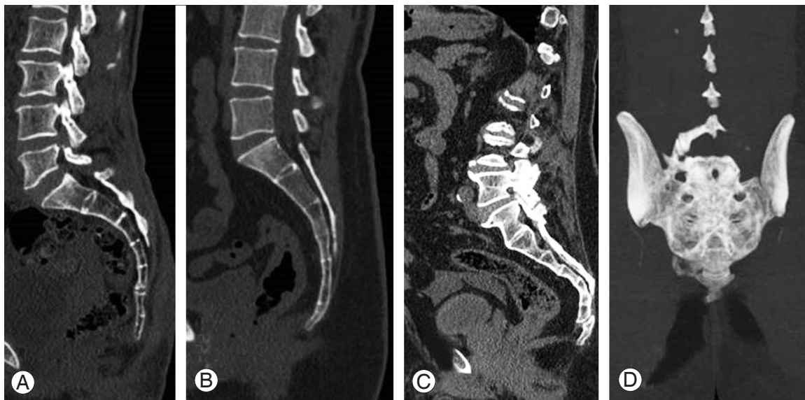
Fig. 2. Sagittal reformats showing (A) intercoccygeal fusion, (B) sacrococcygeal and intercoccygeal fusion, and (C) sacrococcygeal subluxation. (D) Coronal maximum intensity projection image shows lateral deviation of the tip of the coccyx to the right side.