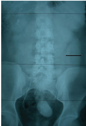
FIGURE 2: Preoperative intravenous pyelography.