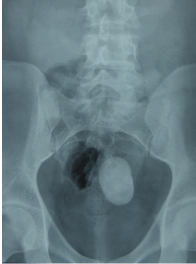
FIGURE 1: Preoperative direct urinary system radiography.