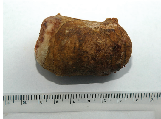
FIGURE 3: A giant ureter stone.