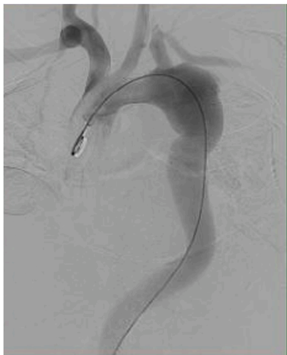
Fig. 2. Conventional aortography during TEVAR confirming the size and site of descending thoracic aortic aneurysm.

TAA occurs due to a weakness of the wall of the aorta. It's difficult to know the exact incidence and prevalence of this condition because it's