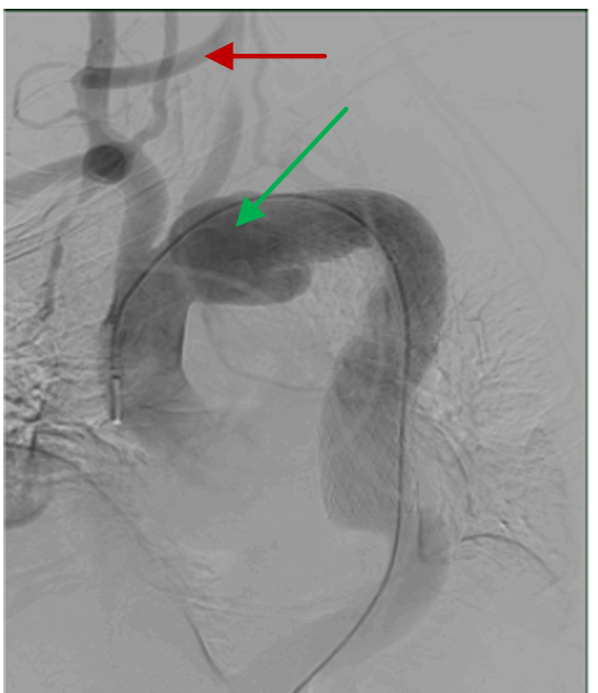
Fig. 4. Intraoperative aortography showing patent right to left carotid shunt (Red arrow) and large aortic arch aneurysm and leak (green arrow). (For interpretation of the references to colour in this figure legend, the reader is referred to the web version of this article.)