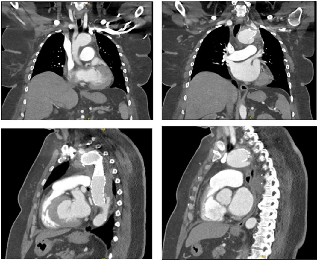
Fig. 3. Coronal and Sagittal views of CT angiography of the aorta showing expansion of aneurysm of the aortic arch 2 months after TEVAR.