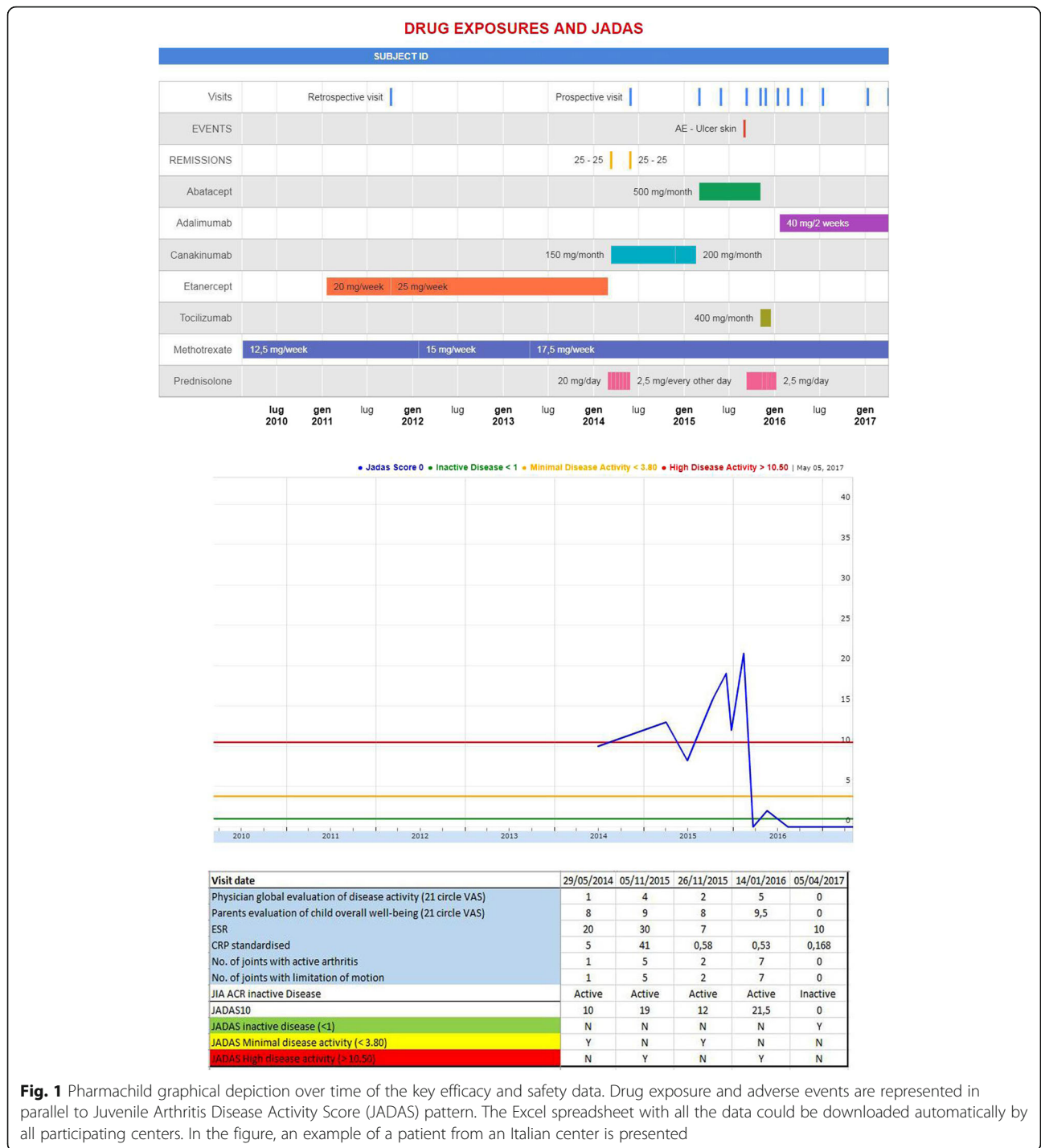
Fig. 1 PharmacChild graphical depiction over time of the key efficacy and safety data. Drug exposure and adverse events are represented in parallel to Juvenile Arthritis Disease Activity Score (JADAS) pattern. The Excel spreadsheet with all the data could be downloaded automatically by all participating centers. In the figure, an example of a patient from an Italian center is presented

belonging to 86 participating centers. Sixty out (61.2%) of eighty-six centers provided at least 70% safety data of their local JIA patients, and the median was 55 patients per center. Prospective data were collected for a total of 3070 patients.