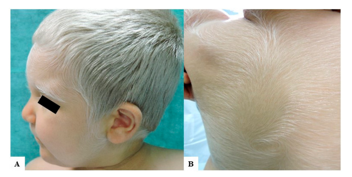
Figure 1. Clinical findings of our patient. ( A ) A 2-year-old Caucasian child with congenital silvery gray scalp hair, eyebrows, and eyelashes and fair skin. He had also brown irises and very fair skin with mild tanning capacities after sun exposure; ( B ) Diffuse silvery hypertrichosis: unmedullated, short, and soft hypopigmented hairs on the back of the patient.

A Caucasian male child came to our attention for inborn generalized hypopigmentation of scalp and body hair. He showed congenital silvery gray hair, eyelashes, and eyebrows (Figure 1A), without neurological and hearing impairment, facial dimorphism, or history of seizures.