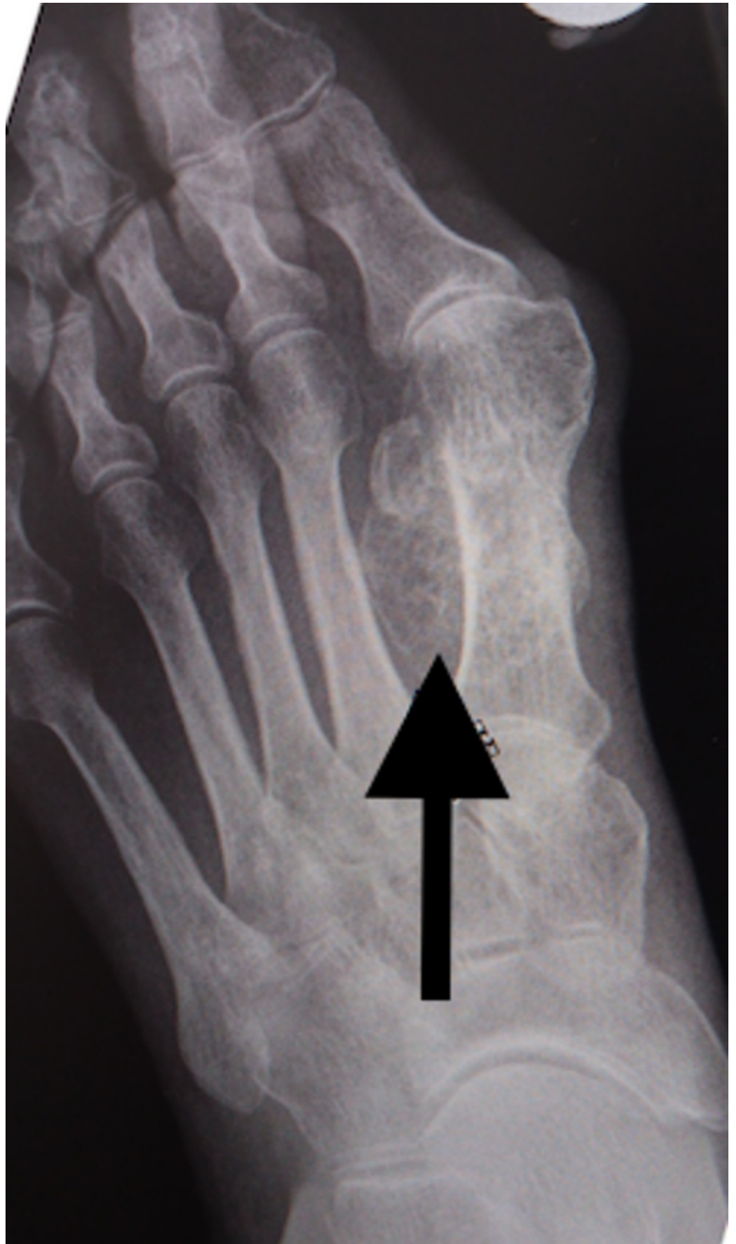
FIGURE 1: X-ray of osteochondroma.