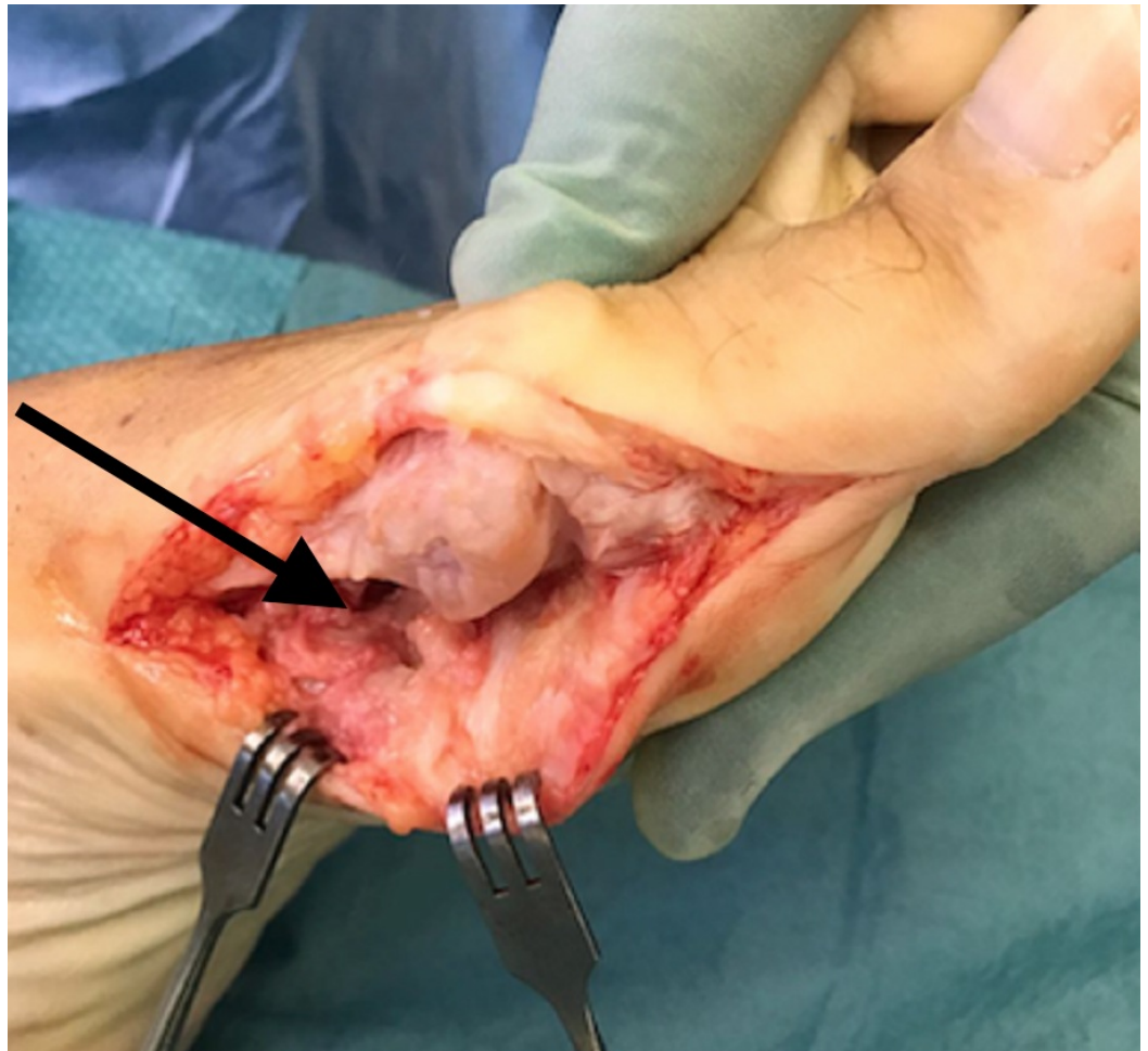
FIGURE 3: Excision of osteochondroma.

Arrow showing the excision of the osteochondroma on the plantar surface.