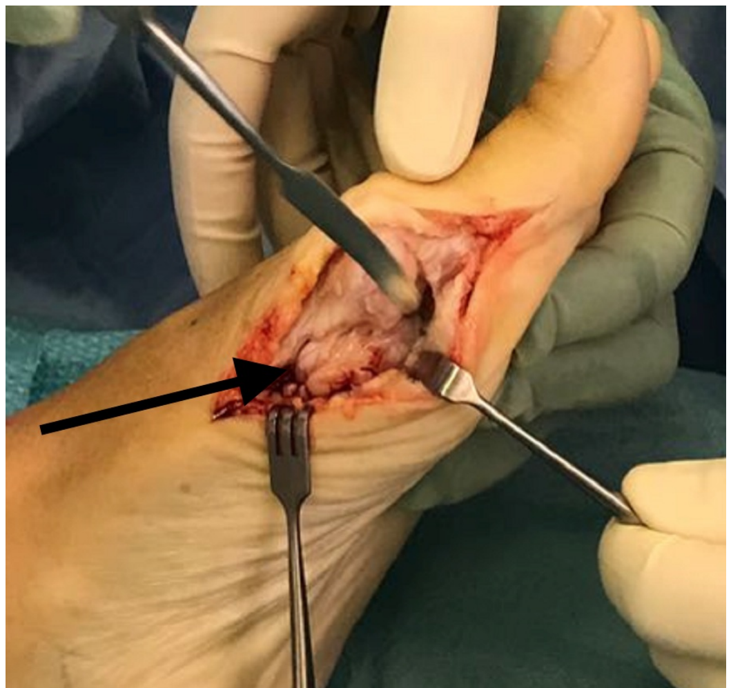
FIGURE 2: Osteochondroma.

She was given general anaesthesia and placed in the supine position. We made a medial 5 cm incision over the left first metatarsal to gain access to the underlying structures. Once the underlying tissue was dissected, the lesion was revealed as a sessile mass over the head and neck of the plantar surface of the first metatarsal (Figure 2). We excised the mass using an osteotome (Figure 3). We cleaned the site and performed closure in layers. The mass was sent for a histopathology examination, which confirmed trabecular bone with fibrocartilaginous cap, indicative of osteochondroma (Figure 4, Figure 5).