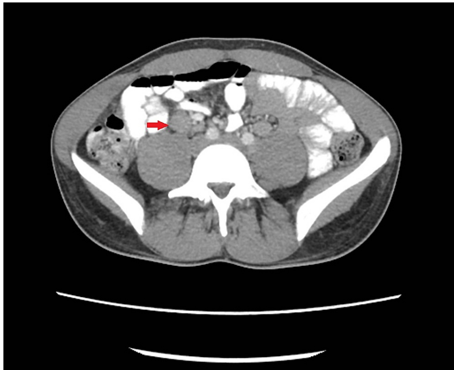
FIGURE 1: Axial image from CT of the abdomen and pelvis with oral and IV contrast demonstrates a cluster of enlarged mesenteric lymph nodes in the right lower quadrant (red arrow).