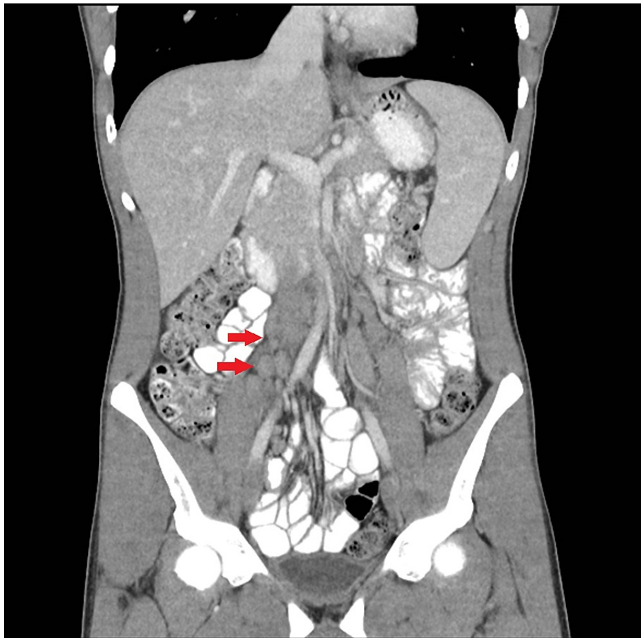
FIGURE 3: Coronal reconstructed image from CT abdomen and pelvis performed seven weeks after the initial CT shows stable enlarged mesenteric lymph nodes in the right lower quadrant (red arrows).

Repeat COVID-19 testing was not performed at this time due to limited testing availability and due to the patient's lack of symptoms. CT scan performed four months after initial diagnosis showed resolution of the lymphadenopathy.