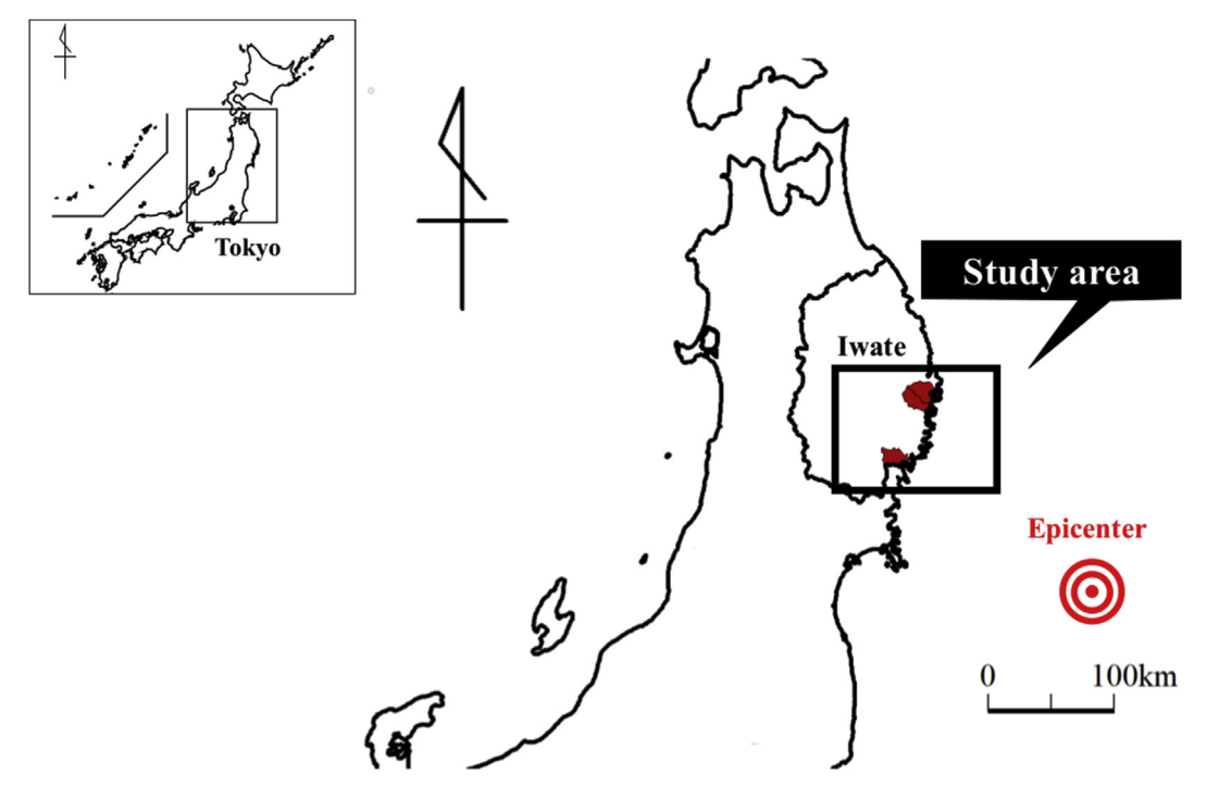
Fig. 1. Map of the present study area

MetS was defined according to the criteria of the International Diabetes Federation (IDF) [10]. Patients with MetS must have central obesity (waist circumference \geq 90 cm in men and \geq 80 cm in women) plus two or more of the following four components: (1) elevated triglyceride level ( \geq 150 mg/dL or medical history or presence of pharmacological treatment for dyslipidemia); (2) low HDL cholesterol (<40 mg/dL in men and <50 mg/dL in women, or medical history or presence of pharmacological treatment for dyslipidemia); (3) elevated blood pressure (systolic \geq 130 mmHg and/or diastolic \geq 85 mmHg, or taking antihypertensive agents); (4)