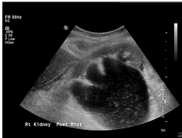
Figure 3 Persisting hydronephrosis on ultrasound with debris.

out in small aliquots and without obstruction into her bladder with just a little hold up over her iliac vessels (Figure 4).