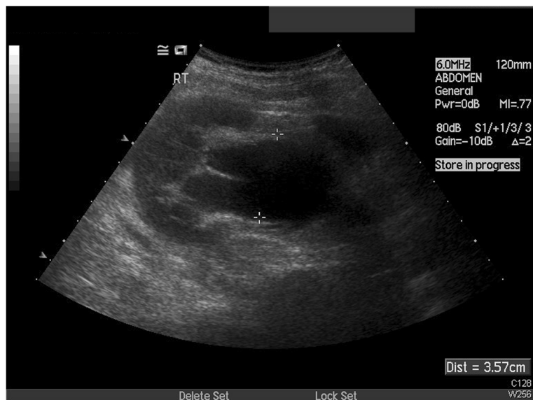
Figure 2 Ultrasound with hydronephrosis and dilated pelvis.

In terms of her outpatient investigations, she underwent a dimercaptosuccinic acid renogram, which showed 52% function in her right kidney and 48% in her left. A nephrostogram revealed a grossly distended right pelvicalyceal system in a PUJO pattern. The contrast passed