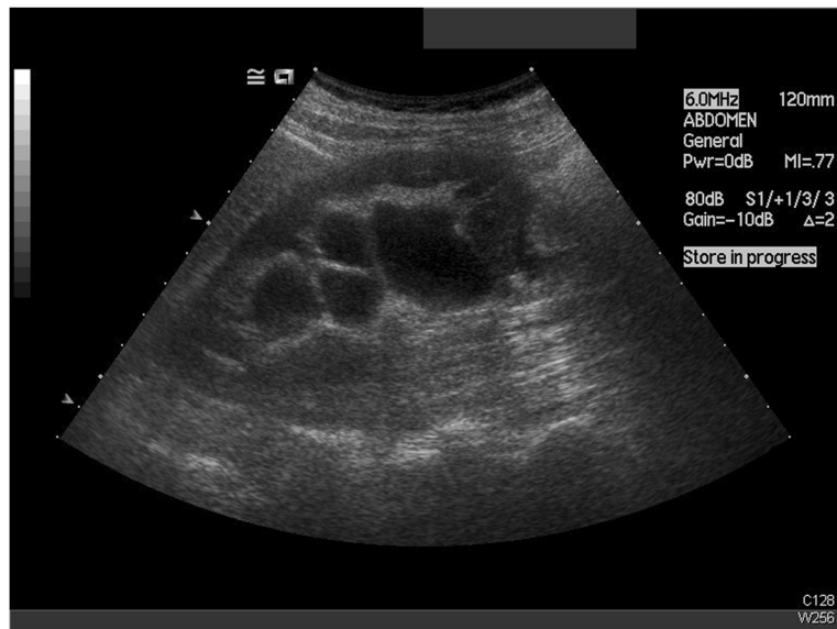
Figure 1 Ultrasound demonstrating hydronephrosis.

a long-standing right PUJO and some prominent lymph nodes in her porta hepatis (Figures 1 and 2).