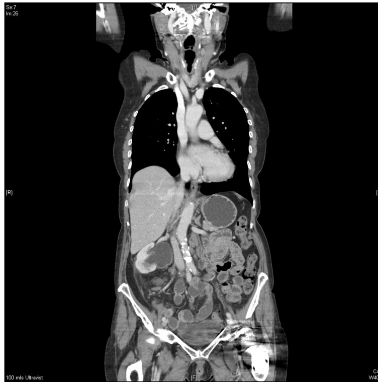
Figure 6 Computed tomography scan with persisting right PUJO and minor lymphadenopathy.

one should be suspicious of attributing the finding to a congenital condition.