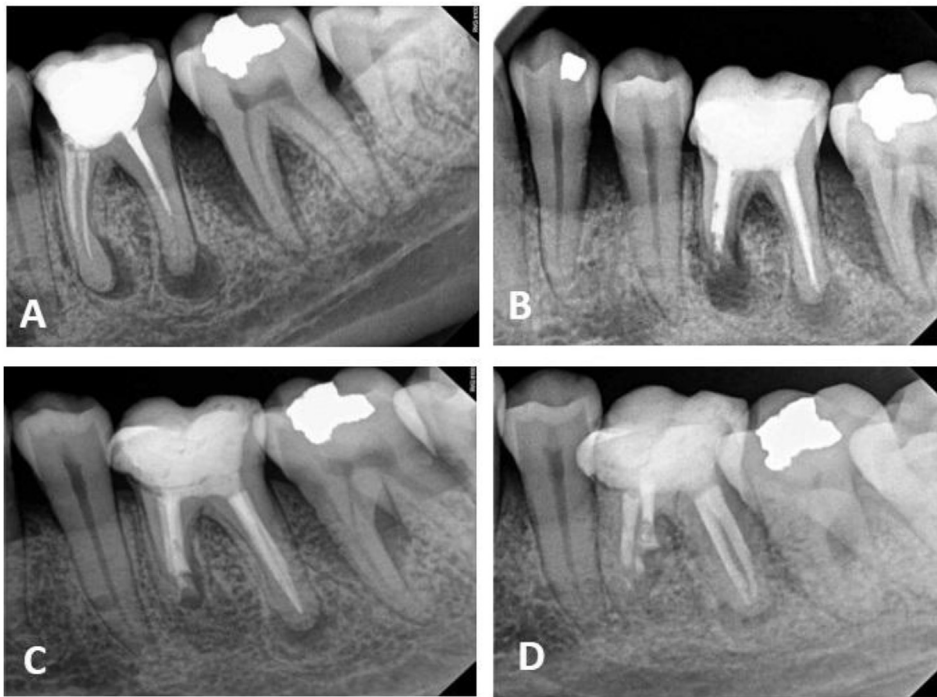
Figure 4: Radiographic assessment of treatment outcome. (A) Pre-Operative Radiographs. (B) Post-Apical Surgery radiograph. (C) 6 months follow up radiographs. (D) 1 year follow up radiographs.

the standard procedure for differential diagnosis. Unfortunately, biopsy has not been considered for this case, which can be counted as one limitation. Additionally, CBCT enables accurate 3-D measurements. 12 Therefore, CBCT is an important tool in diagnosis and treatment planning. 14 The treatment of generalized aggressive periodontitis included several surgical and non-surgical procedures supplemented by antibiotics. 8