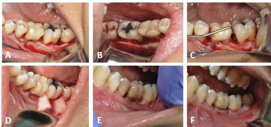
Figure 2: Regenerative periodontal surgery of lower left quadrant.