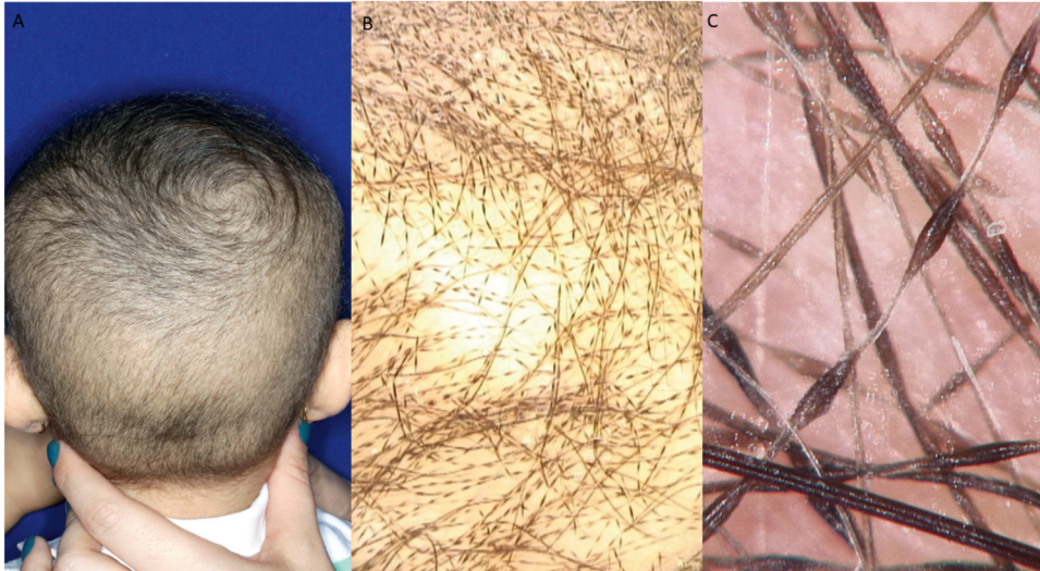
Figure 1 One-year-old girl. (A), Clinical aspect. (B), Trichoscopy (macroscopic aspect). (C), Trichoscopy ( \times 70 magnification).