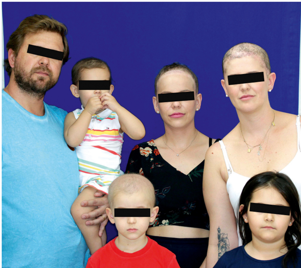
Figure 6 Variability of the clinical expression of monilethrix in the affected family members.