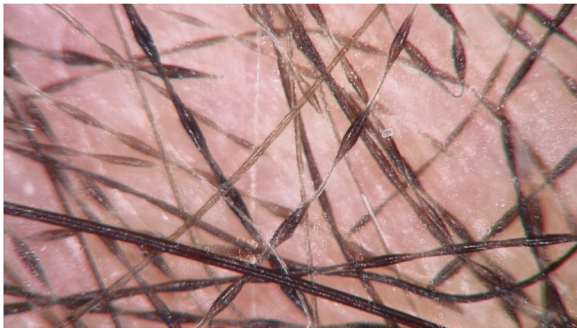
Figure 4 Trichoscopy with regular variations in the diameter of the hair shaft, with elliptical dilations and constrictions ( \times 70 magnification).

wide or nodular part of the hair corresponds to the normal thickness of the shaft containing the medulla and the internodal narrowing corresponds to the anomaly, with the absence of the medulla being the cause of the shaft thinning. The nodules are elliptical, separated by 0.7 to 1.0 mm intervals showing normal thickness or a slightly lower than the normal shaft diameter. Fragility and fractures can be observed at the constriction points. 4