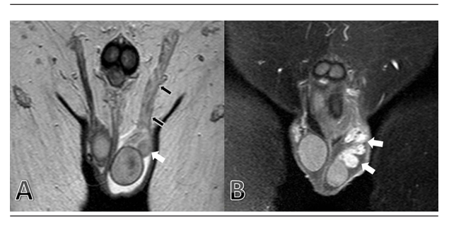
(a) MR Imaging Shows Marked Edema of the Left Epididymis (Headtail and Body, White Arrows) and Ductus Deferens (Black Arrows). After Contrast Media Administration on Coronal TI-weighted (b) MR Imaging Shows Marked Enhancement of the Left Epididymis (Head-Tail and Body, White Arrows).

Cardiologist was decided to continue Amiodarone treatment and decided to control the pain with analgesics. Upon received of the response to analgesic treatment in the first 2 days, patient was followed for 3 months of period. During this period of time he has continued Amiodarone medication at the same dosage. He defined that his scrotal pain was decreased little by little and he did not require any analgesic anymore. Doppler ultrasound imaging was repeated to control the vascularization of the epididyms, by same radiologist in order to avoid in-