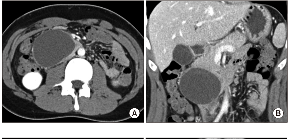
Fig. 2. Abdominopelvic CT follow up taken on 14th day of admission showed minimal decrease in size of intramural hematoma of duodenum. (A) is axial view and (B) is coronal view.