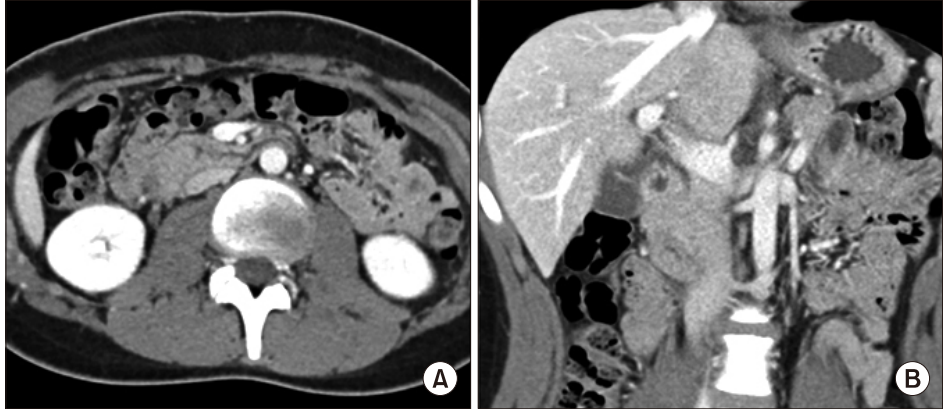
Fig. 3. Abdominopelvic CT follow up taken on 7th week after diagnosis of IMDH showed completely resolved with very minimal periduodenal fluid left. (A) is axial view and (B) is coronal view.