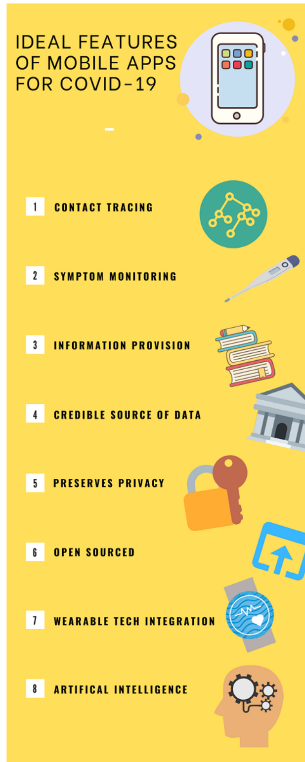
Figure 2. Ideal features of mobile apps for COVID-19. COVID-19: coronavirus disease.