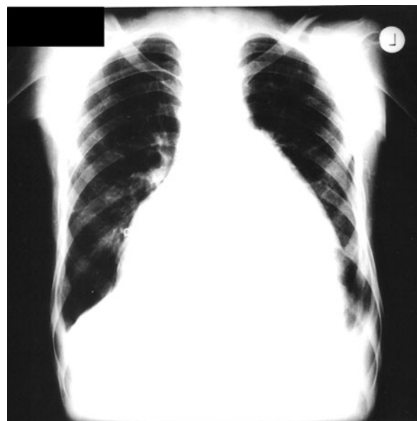
Fig. 1 Massive pericardial effusion seen on chest X-ray

Three months later, hepatic encephalopathy and massive pericardial effusion developed, which was confirmed by an upright chest X-ray (Fig. 1) and echocardiography. Despite frequent hemodialysis over 7 days, there was no reduction in the amount of pericardial fluid, and cardiac tamponade developed. A pericardial tube insertion was applied subxiphoidally by surgical method and 3,500 cc pericardial fluid was drained. During the procedure, a pericardial fluid sample was taken and a biopsy was performed. Providencia stuarti was isolated and the pathologic diagnosis was acute nonspecific pericarditis.