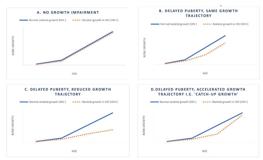
Figure 2 Hypothesised growth scenarios to be assessed as interactions between pubertal stage and HIV status on change in bone mass.