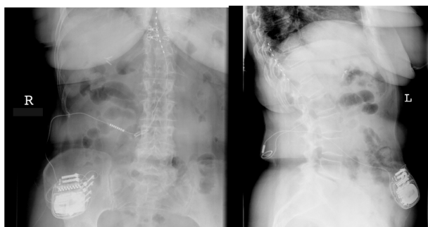
Figure 2 Anteroposterior and lateral view of a thoracolumbar spinal cord stimulation placement; the 8-pole lead (octrode) is positioned at level TH10-12, and the impulse generator is placed abdominally subcutaneously. Abbreviations: R, right; L, left.