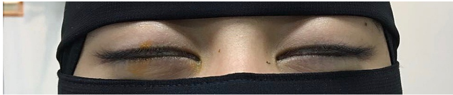
FIGURE 1: Bilateral lagophthalmos measuring 2 mm in width.

Hertel exophthalmometry, which yielded measurements of 16.1 mm bilaterally. Extraocular muscle movements were normal and exhibited the full range of motion. Examination of cranial nerves III, IV, V, VI, and VII shows them to be intact and fully functional.