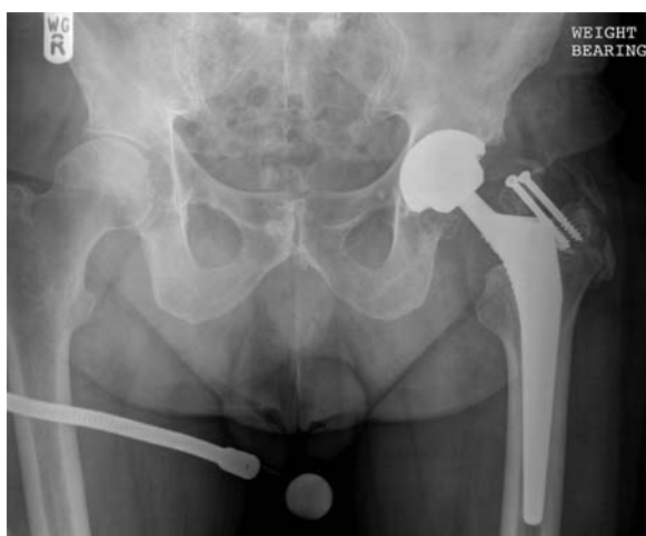
Figure 2 Anteroposterior radiograph of the pelvis showing the acetabular liner fracture, 15 months postoperatively