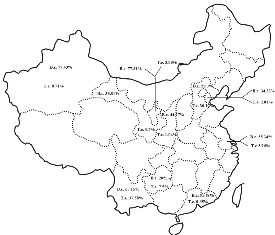
Fig. 2. The seroprevalence of B. caballi and T. equi infections and sampling locations.

Shaanxi province (1.04%). Notably, the seroprevalence of B. caballi was significantly higher than that of T. equi in nine provinces, except for Hebei. Differences in the positive rate might be caused by the difference in distribution of tick vectors or the use of horses.