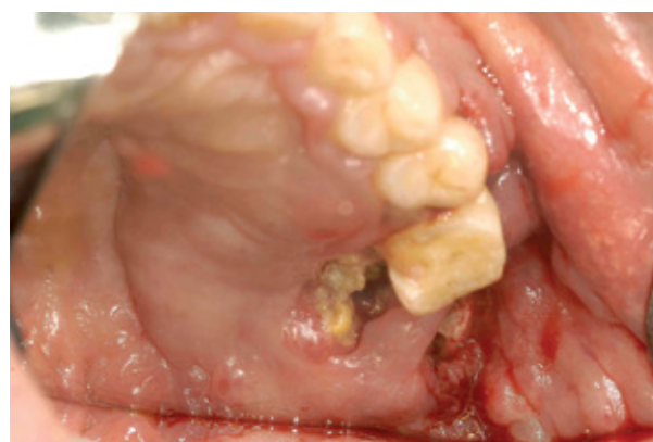
Fig. 4. At 50 days after extraction, pus discharge from the wound and sequestra formation are observed.

bility of the third molar. Panoramic and periapical radiographs showed a carious lesion on the teeth extending into the subgingival area, but the radiographs did not show a bony destructive lesion in the left maxillary posterior region (Fig. 1). Since the endodontic treatment of subgingival carious lesions cannot be guaranteed to be successful, extraction was considered. However, BRONJ was a concern because the patient had been administered pamidronate for two years, followed by zoledronate for five years, to treat multiple myeloma. Moreover, the patient did not accept extraction as a treatment option, so tooth extraction was postponed. This patient had been diagnosed with multiple myeloma (IgG kappa type) nine years previously and