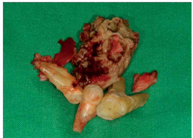
Fig. 6. A photograph shows the extracted premolars, the first molar, and a necrotized bone fragment.

A panoramic radiograph and computed tomograph per-