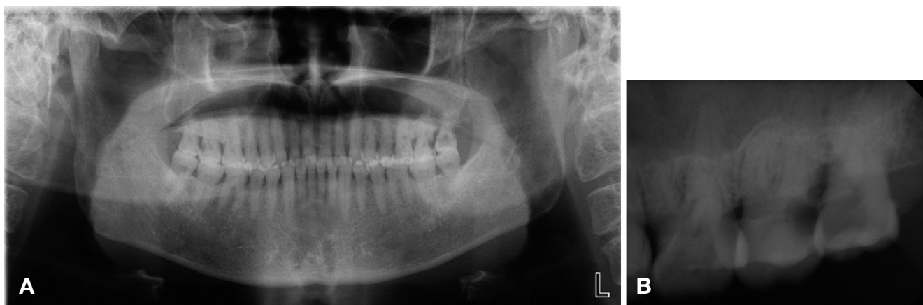
Fig. 1. A panoramic radiograph (A) and periapical radiograph (B) show a carious lesion on the maxillary first, second, and third molars extending into the subgingival area, with a suspected mucosal antral cyst in the left maxillary sinus.