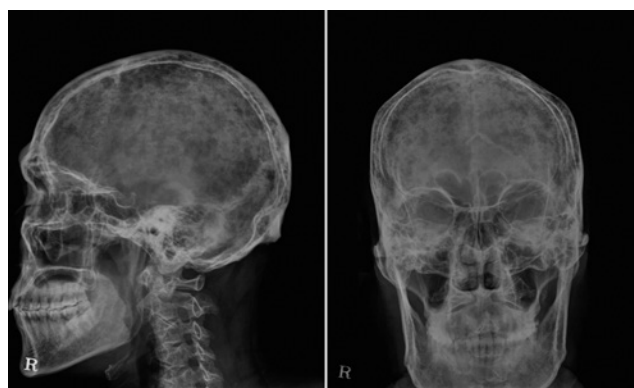
Fig. 3. Skull radiographs show a punched-out appearance.

bility of the third molar. Panoramic and periapical radiographs showed a carious lesion on the teeth extending into the subgingival area, but the radiographs did not show a bony destructive lesion in the left maxillary posterior region (Fig. 1). Since the endodontic treatment of subgingival carious lesions cannot be guaranteed to be successful, extraction was considered. However, BRONJ was a concern because the patient had been administered pamidronate for two years, followed by zoledronate for five years, to treat multiple myeloma. Moreover, the patient did not accept extraction as a treatment option, so tooth extraction was postponed. This patient had been diagnosed with multiple myeloma (IgG kappa type) nine years previously and