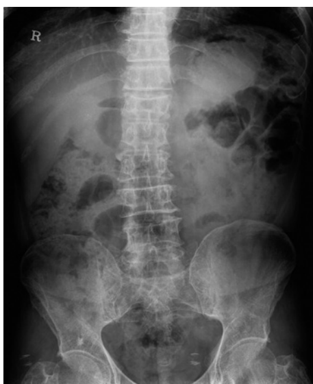
Fig. 2. Compression fracture of T12 and diffuse osteopenia of the pelvic bone.