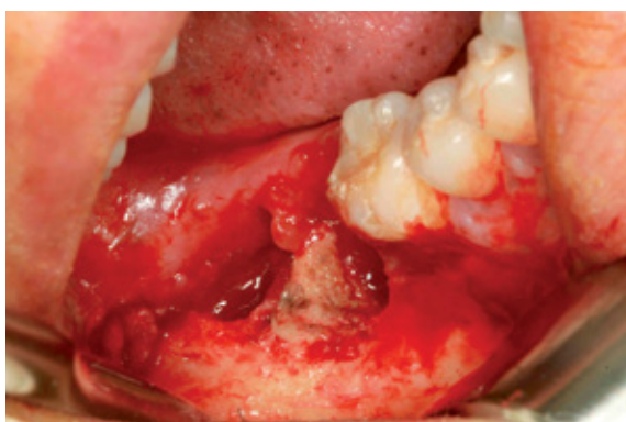
Fig. 8. A photograph shows the necrotic interseptum of the right lower second molar.

ing occurred in the right mandibular posterior teeth six months later. An intraoral examination showed gingival swelling around the second and third molars. A periapical radiograph showed only moderate periodontitis and proximal caries on the distal surface of the first molar, but no specific finding of osteolysis related to osteonecrosis around the root surface was observed (Fig. 7). The interseptum of the right lower second molar was observed to be necrotic during surgery (Fig. 8). The diagnosis of BRONJ in the left maxilla and right mandible in a multiple myeloma patient was made based on these clinical and radiographic findings.