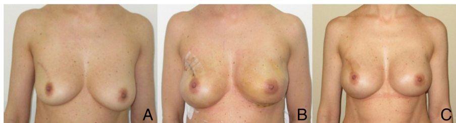
Figure 2 Case 2. A: 45 YO, preoperative view, previous quadrantectomy without Radiotherapy on the right breast, grade 1 multifocal carcinoma on the left breast. B: Left breast: therapeutic nipple skin sparing mastectomy direct to implant Allergan 410 Style MF 420 and SERI®. 2 weeks postop. Right breast: prophylactic nipple skin sparing mastectomy direct to implant Allergan 410 Style MF 420 and SERI®. 2 weeks postop. C: 4 months postop.

Our early breast revision rate in direct-to-implant single-stage immediate breast reconstruction patients was 4,7 percent (one case), which is slightly lower than the revision rate of 28.6 percent recently reported in a