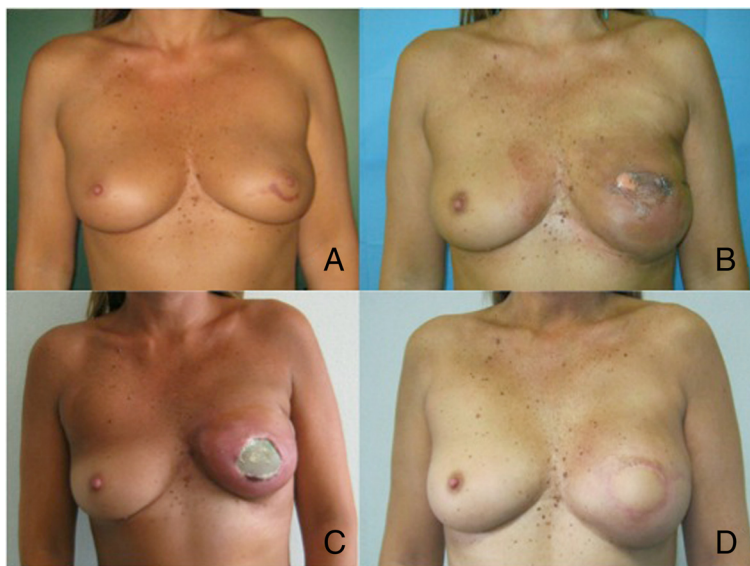
Figure 3 Case 3. A: 51 YO, preoperative view, previous biopsy grade 2 intraductal carcinoma on the left breast. B: Therapeutic nipple skin sparing mastectomy direct to implant Allergan 410 Style MF 375 and SERI®. 3 weeks postop, initial skin suffering. C: 2 months postop implant and SERI® exposure before reoperation. D: 7 months postop after implant explantation and Latissimus dorsi miocutaneous flap as a salvage procedure with Allergan 410 MF 335.

small direct-to-implant single-stage immediate breast reconstruction series by Roostaeian [38]. In the largest series by Salzberg et al., an overall revision rate of 19.1 percent can be deduced by combining elective revisions (15.2 percent) with revisions resulting from complications (3.9 percent) [39]. Given that, this cohort represents our early experience using SERI®, our lower early revision rate may be attributable to the restriction of indications associated with this technique.