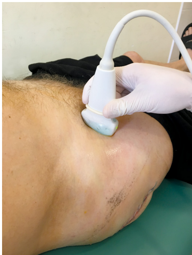
Fig. 2. US probe position to evaluate the fluid level

articular spaces (Fig. 1). A US examination was performed with the patients in the supine position. All examinations were conducted with a GE Healthcare system using a linear 10–15 MHz probe or a convex 5–8 MHz probe, depending on the thickness of tissues in the region of the prosthesis. For aseptic purposes, a latex cap, disinfected with an antiseptic agent, was placed on the probe covered with gel (Fig. 2, 3). Ultrasonography provided information about the size of a postoperative hematoma and its location, either in the joint or in the subcutaneous tissues. Apart from US, typical postoperative procedures were carried out in all patients: complete blood count and CRP (C-reactive protein) were controlled and rehabilitation assessment protocols were applied starting from day 2 after surgery. The clinical state of the patients was assessed by the HHS (Harris Hip Score) score. Statistical calculations were performed in Statistica 12. The normality of distribution was checked with the Shapiro-Wilk test. Comparisons between the groups were made using the Student's t test for independent samples in the case of variables with normal distribution, and Mann-Whitney U test for variables with non-normal distribution.