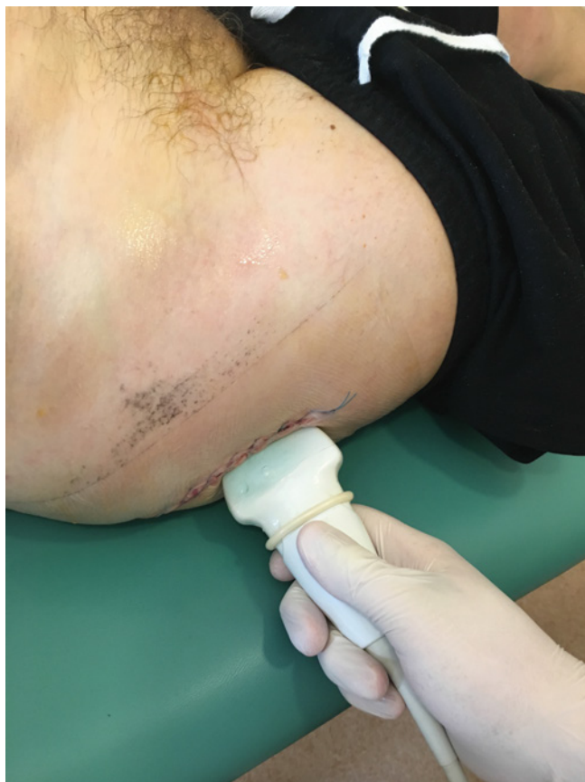
Fig. 3. Probe position at the wound

For quantitative variables, means plus standard deviation or median and minimum plus maximum values were calculated, depending on the type of distribution. For qualitative variables their quantity and percentage distribution was shown. Correlations of parametric variables were analyzed by the Spearman's test. Interrelations between quali-