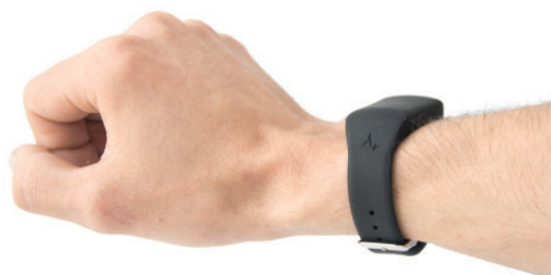
Figure 1. CueS wristband.

SVM increase across all recorded prompts of 0.15g (0.03) or 19.8% (4.3%) ( p=0.03 ). Figure 3 represents the average activity per minute of the affected limb across all participants in the hour before and after delivery of a prompt. The increase appears greatest in the second half of the hour afterwards, increasing from 0.0111 in the half hour before the prompt to 0.0125 in the half hour directly afterwards, and then further increasing to 0.0139 at between 31 and 60 min. This could suggest a change in behaviour to avoid a further